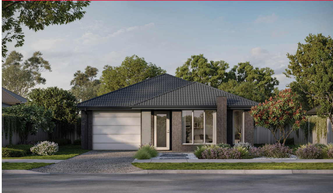
KARRI 16 | EMERGE RANGE